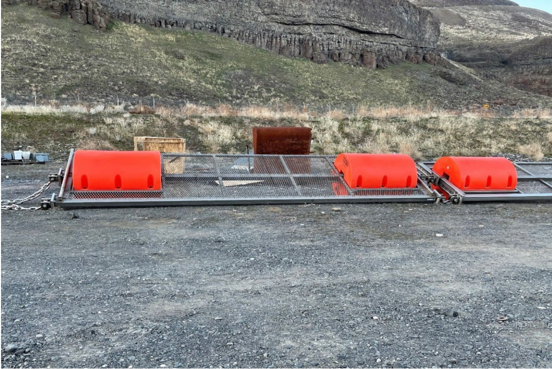
Image 1. One section of the fish ladder exit debris barrier assembled on shore.