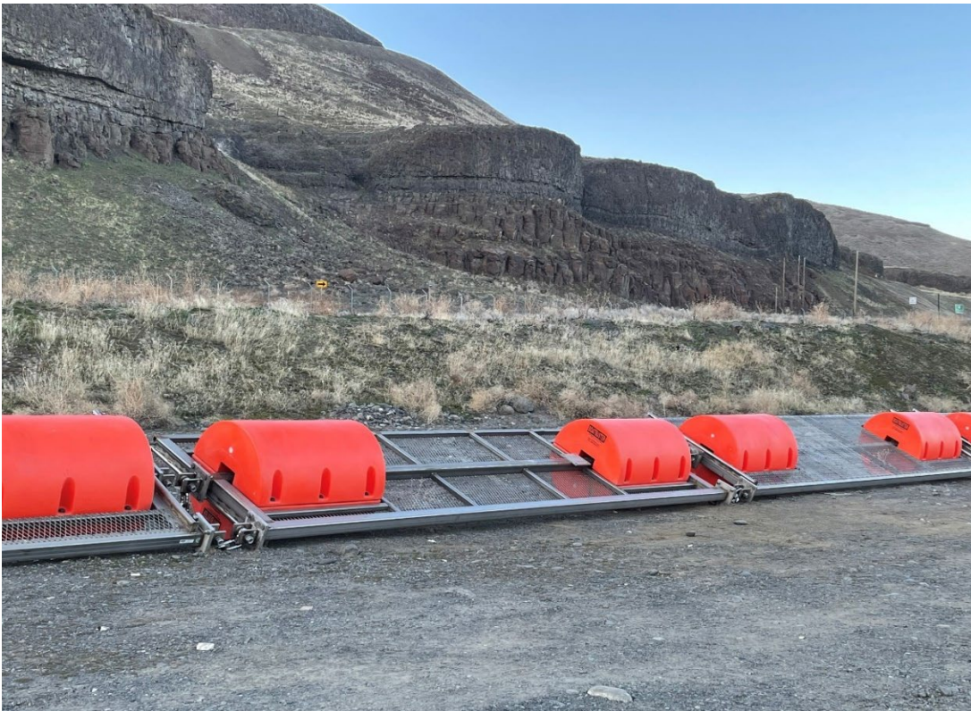
Image 2. Multiple sections of the fish ladder exit debris barriers assembled on shore.